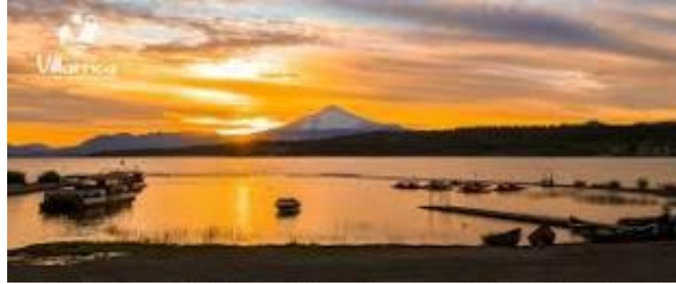
Sunset at Villarrica Lake.