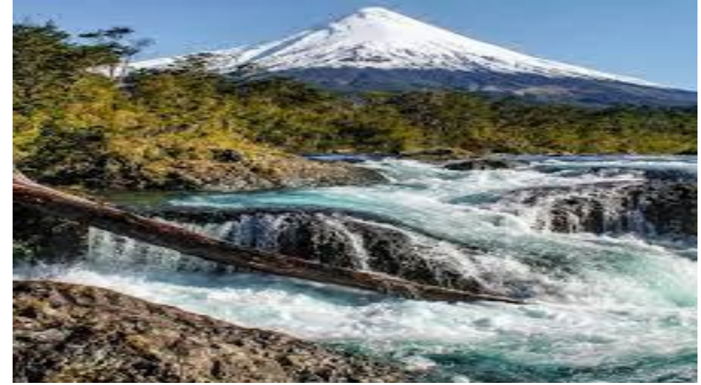
Petrohue Falls at Villarrica National Park.