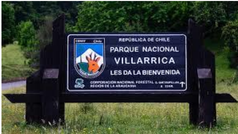
Villarrica National Park.